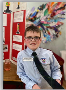
Science Fair 2023 had our creativity and brilliance on full display!