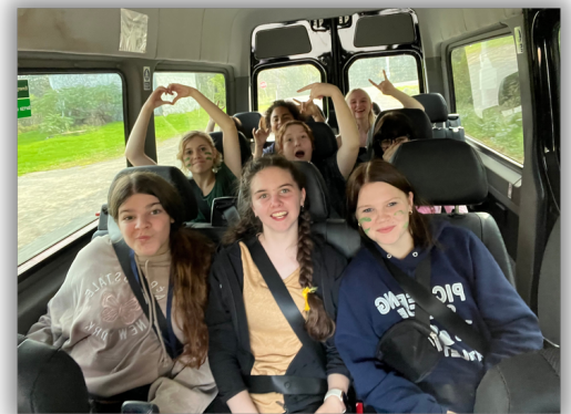
Camp Day and the Ice Cream Social were great ways to build new relationships early in the year!